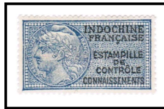
CEPF 21a, 21b

1939. New values and overprints on stamps of 1927.