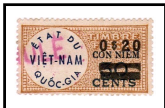
0$20 on 30 cents

1955. Issues of 1953 overprinted "0 $ 20" with bar obliterating original value in black.