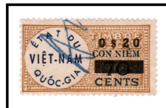
0$20 on 70 cents