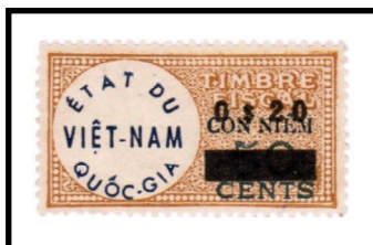
0$20 on 50 cents