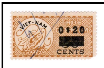
0$20 on 50 cents

1955. Issues of 1954 overprinted "0 $ 20" with bar obliterating original value in black.