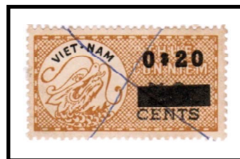
0$20 on 30 cents