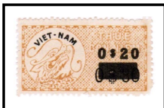
Large 0$20 on 30 cents

1955. Issues of 1955 overprinted "0 $ 20" with bar obliterating original value in black.