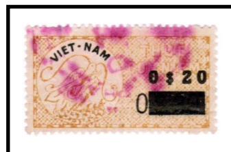
Small 0$20 on 30 cents