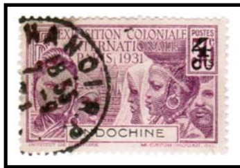
HANOI R.P. TONKIN