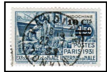
HANOI R.P. TONKIN