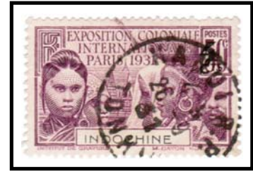
HANOI R.P. TONKIN