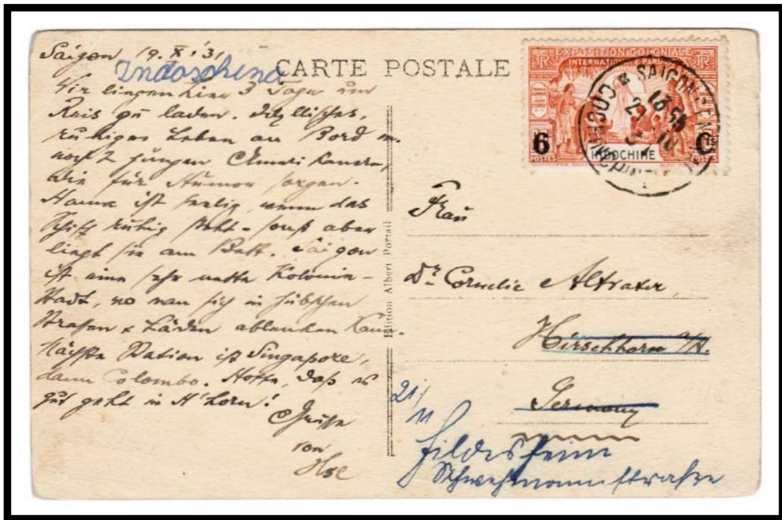
POSTAL MARKINGS SAIGON CENTRAL COCHINCHINE 21-10 31

Here the 6-cent value was used to pay the foreign postcard rate to Germany in 1931.