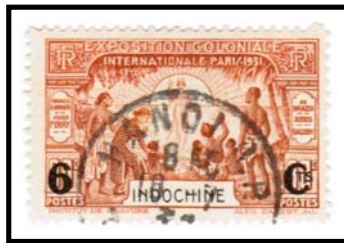
HANOI R.P. TONKIN