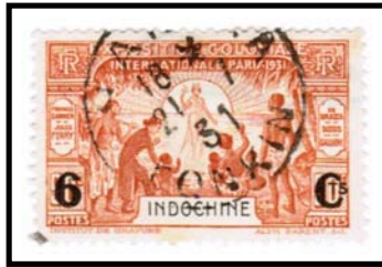
HANOI A TONKIN