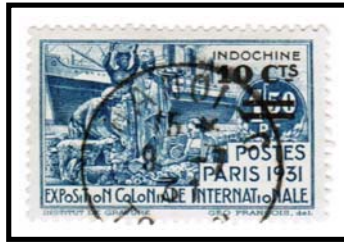
HANOI C TONKIN